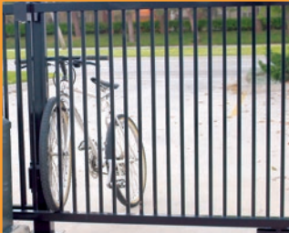
Entrapment Prevention reverses gate when obstructed