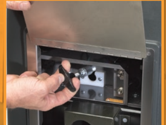
Easy To Use "T-Handle" release