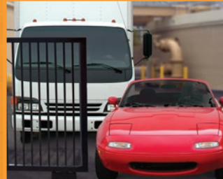
Adjustable Partial Open for different opening distances