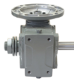
HEAVY DUTY GEARBOX WITH INTERNAL CLUTCH