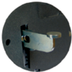
MECHANICAL FOOT PEDAL RELEASE