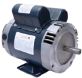
POWERFUL AC MOTOR